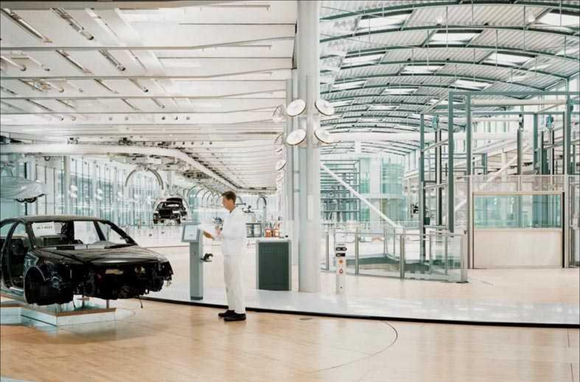
This floor is actually an assembly line and proceeds to the rhythm of the addition of each part after a thorough inspection.