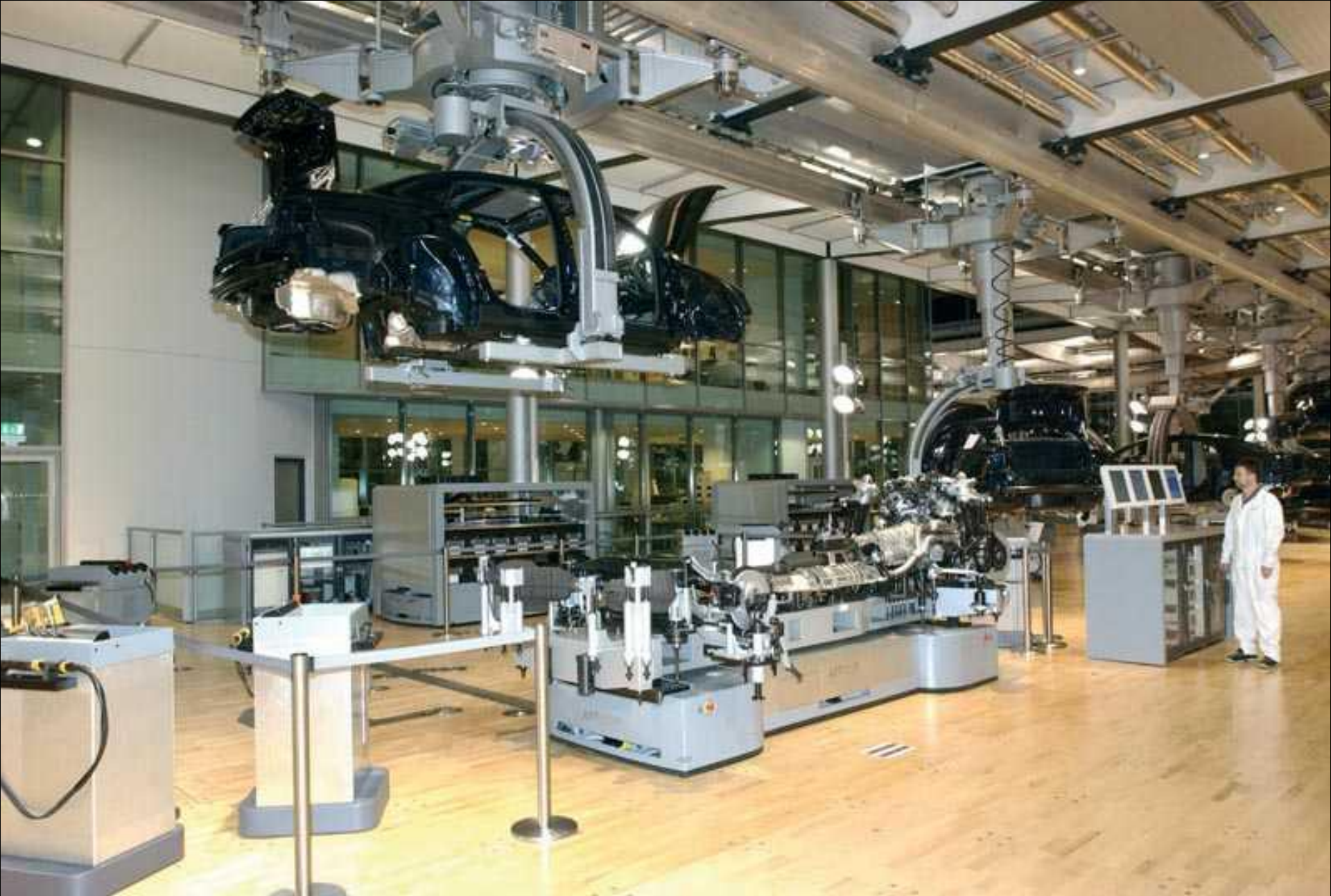
A series of mobile cranes: an assembly line ...