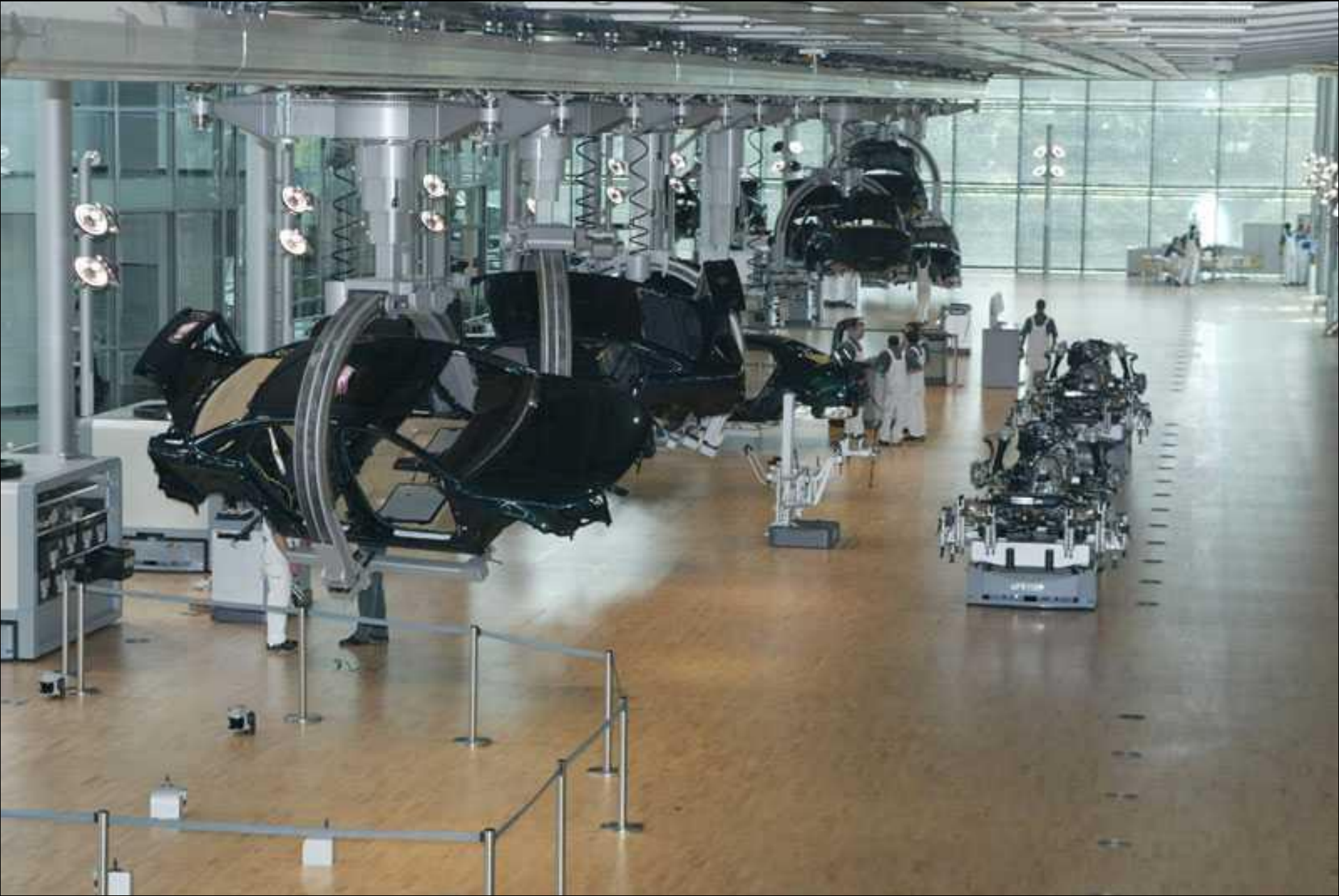
The engines are mounted, along with the transmissions (right).