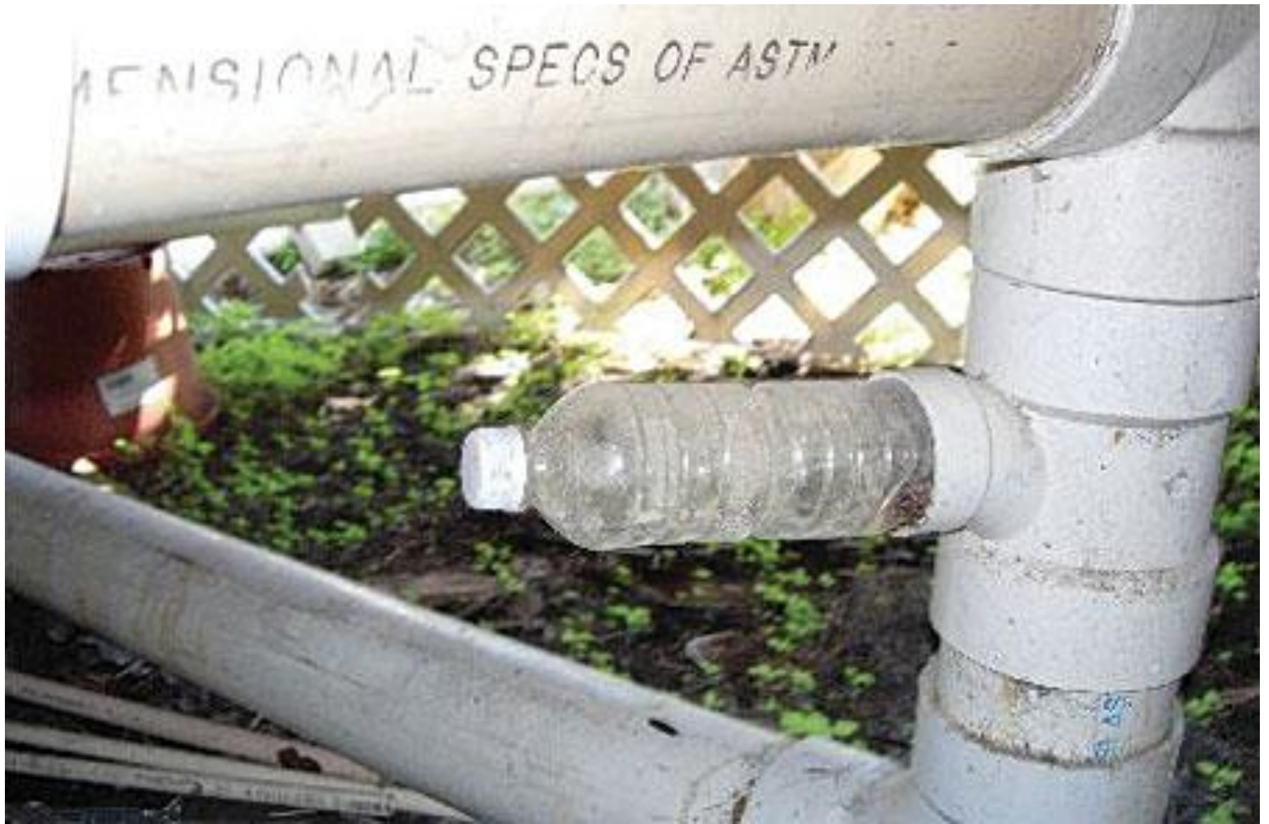
Recycle: Inexpensive plug for the cleanout.