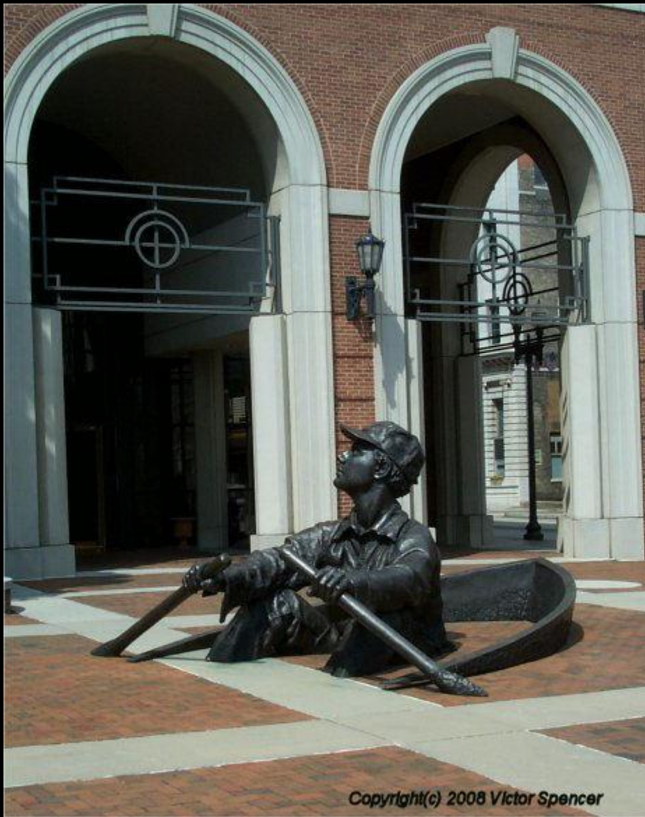
The Oarsman. Location: Knoxville, Tennessee.