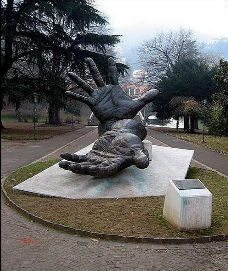
Giant hands. Location: Como, Italy.