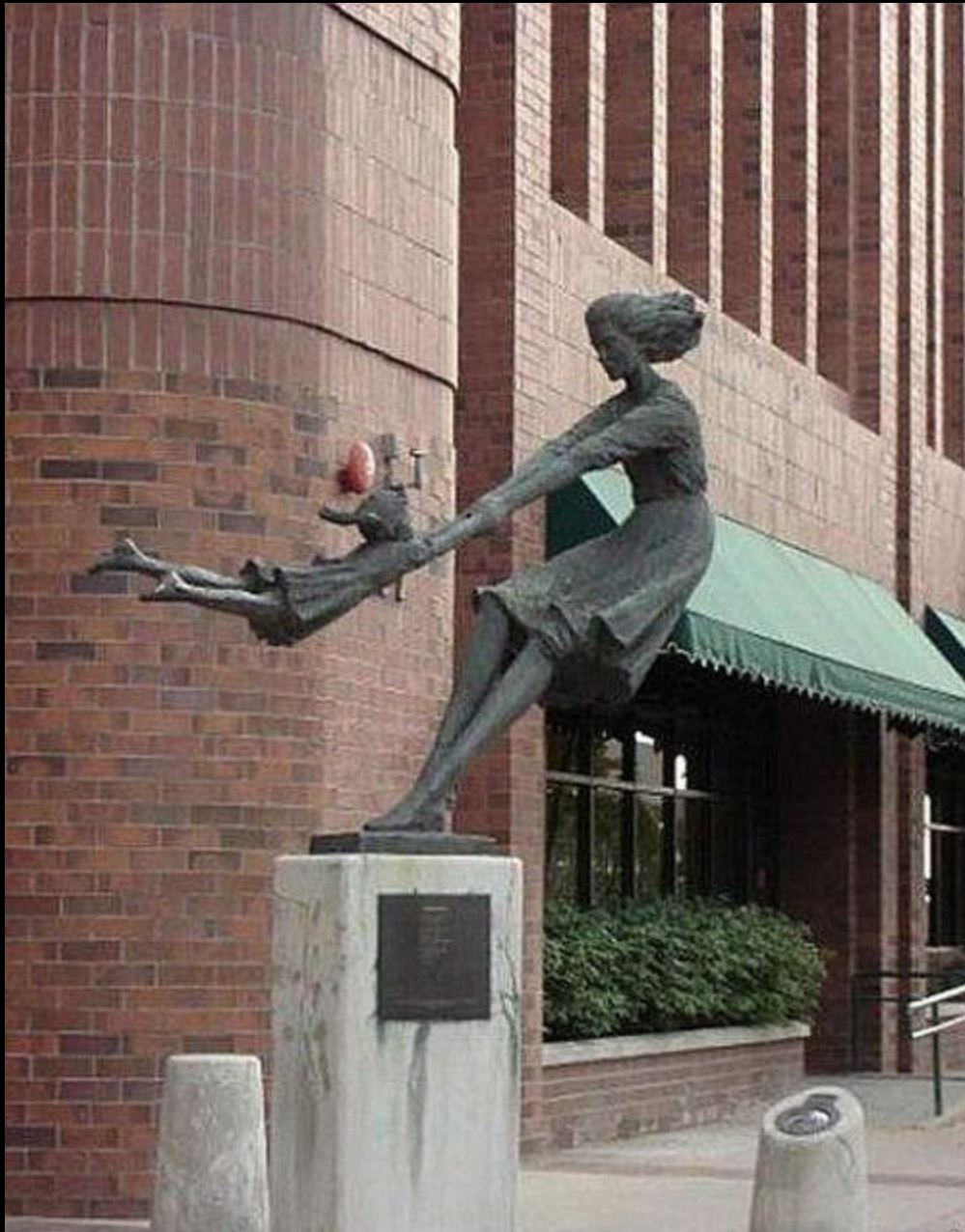
Location: Salt Lake City, Utah.