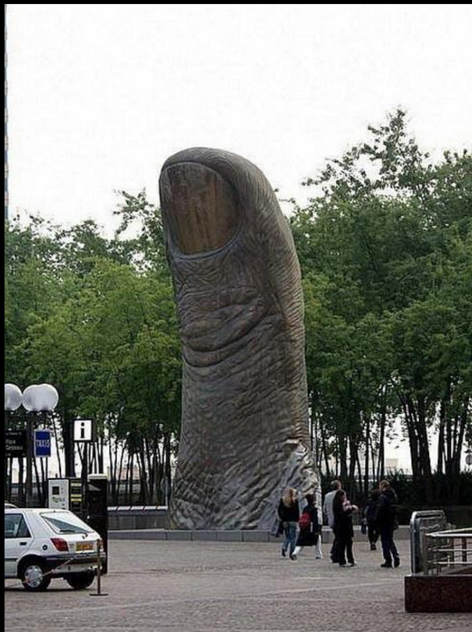
The Thumb. Location: Paris.