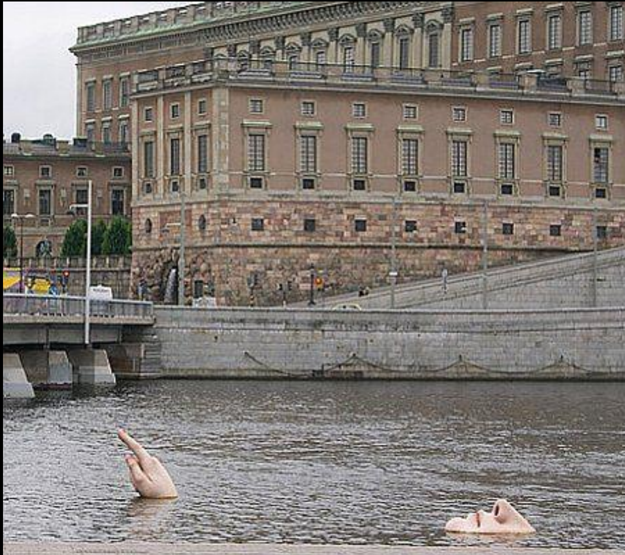
Location: Stockholm, Sweden.